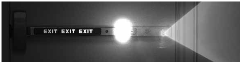
Shown: BT-TL-80 Series Exit Device